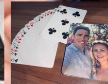
Custom Printed Cards