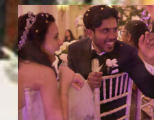
Exclusive Top Table Magic

Magic during two parts of your big day +