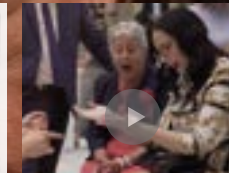
Video of Guest Reactions