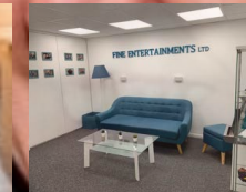
Pre-wedding Sneak Preview