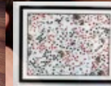
Playing Card Guest Book