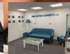
Pre-wedding Sneak Preview