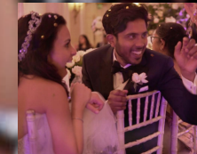
Exclusive Top Table Magic

Magic from the arrival drinks to the dance floor+